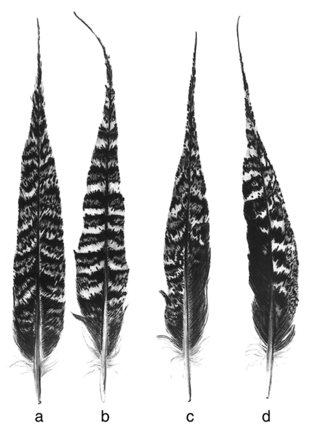
FIG. 2. Rectrices of Gunnison Sage-Grouse (b and d) and Sage-Grouse (a and c). Drawn from life by D. L. Rieden.

male Gunnison Sage-Grouse from Sage-Grouse males are sexually dimorphic traits used during mating displays on the lek (Young et al. 1994). Gunnison Sage-Grouse perform their courtship displays at slower rates (Young et al. 1994). They possess a different mating call in which they pop their air sacs nine times instead of twice as does the Sage-Grouse (Young et al. 1994). Previous studies of sagegrouse indicate that some acoustical aspects of the mating display influence male mating success (Gibson and Bradbury 1985, Gibson et al. 1991). On average, only 10-15% of the adult males breed on the lek each season (J. R. Young, pers. obs.). Yearling and adult females breed; yearling males probably breed rarely.