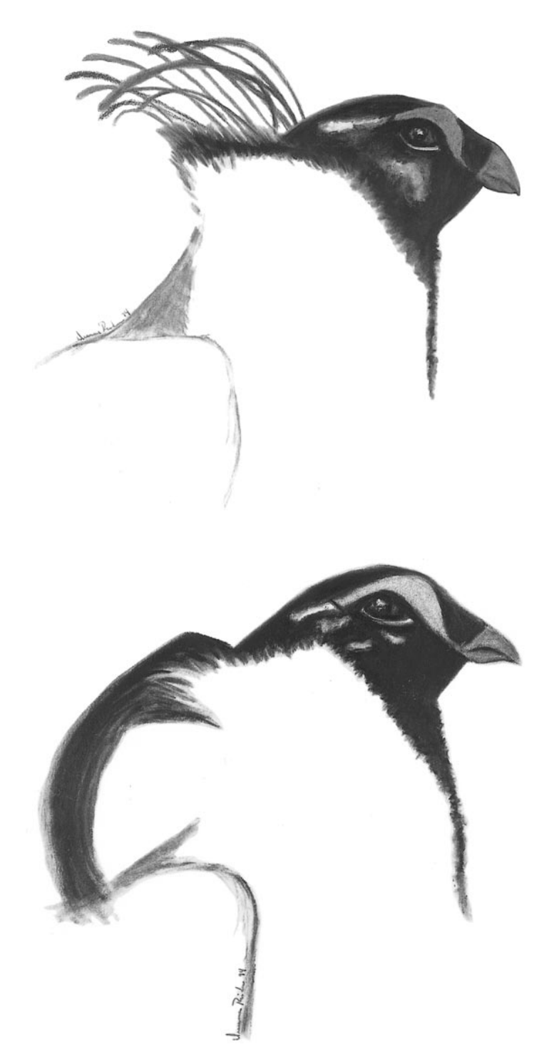
FIG. 3. Lateral views of head and neck of Gunnison Sage-Grouse (lower) and Sage-Grouse (upper). Drawn from life and photos by D. L. Rieden.